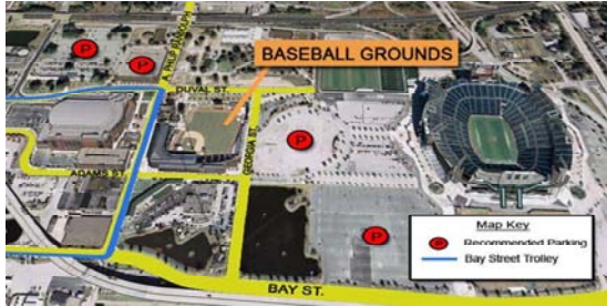
Map - A

7th Annual All Star Games May 21 st The Baseball Grounds of Jacksonville 301 A Philip Randolph Blvd. Jacksonville FL 32202